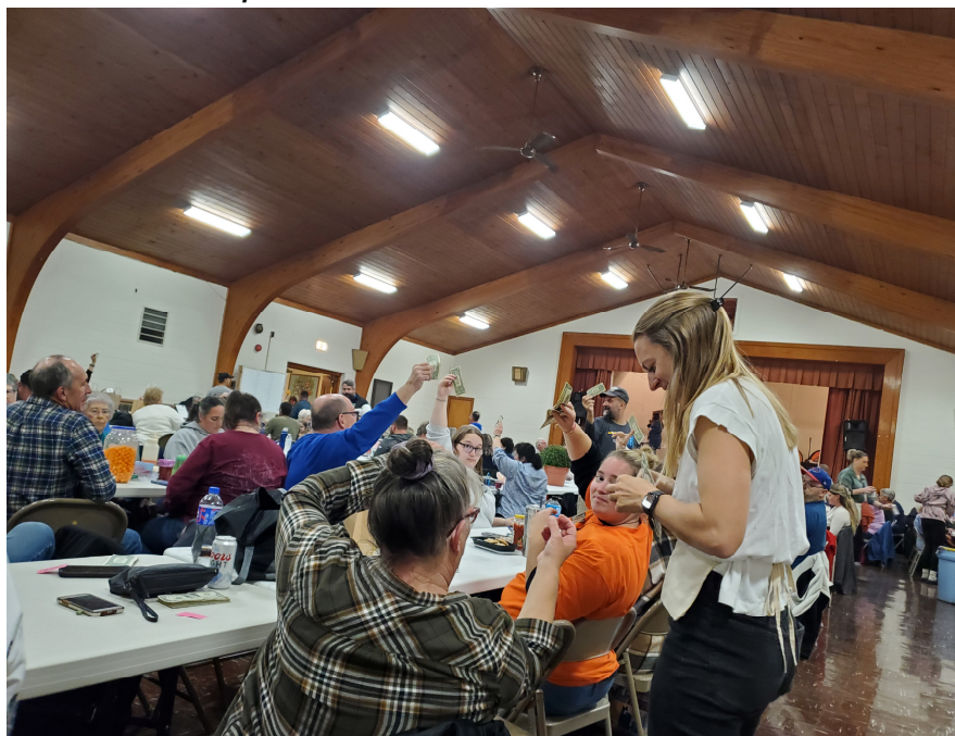
Fun was had by all who attended the 2023 Meat Raffle!

We, the Catholic faith community of St. Teresa of Avila parish, guided by the Holy Spirit, commit ourselves to proclaim and follow the Good News of Jesus Christ. Basing our lives on faith, hope and love, we seek to meet our needs and the spiritual and corporal needs of those around us. It is our humble prayer that our lives will be visible signs of His presence in the world as we celebrate Christ in His Word and Sacraments.