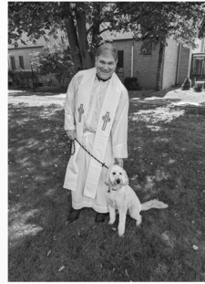
Blessing of Animals held on Saturday, September 30

Religious Education: Have you heard the expression, “Keep the faith”? Does being “family” help you keep the faith? Actually, we share it by our witness, by being in church together, by accepting others with kindness and compassion, by trusting God and “entrusting” each other to His care.