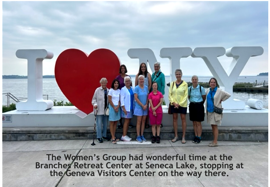
The Women's Group had wonderful time at the Branches Retreat Center at Seneca Lake, stopping at the Geneva Visitors Center on the way there.

We, the Catholic faith community of St. Teresa of Avila parish, guided by the Holy Spirit, commit ourselves to proclaim and follow the Good News of Jesus Christ. Basing our lives on faith, hope and love, we seek to meet our needs and the spiritual and corporal needs of those around us. It is our humble prayer that our lives will be visible signs of His presence in the world as we celebrate Christ in His Word and Sacraments.