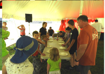
Church Picnic 2023