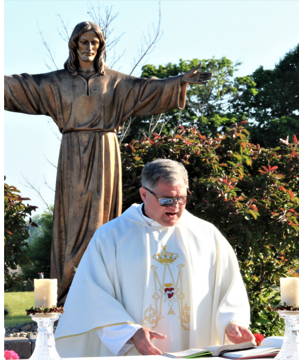
The weather was perfect for the Memorial Day Mass!

We, the Catholic faith community of St. Teresa of Avila parish, guided by the Holy Spirit, commit ourselves to proclaim and follow the Good News of Jesus Christ. Basing our lives on faith, hope and love, we seek to meet our needs and the spiritual and corporal needs of those around us. It is our humble prayer that our lives will be visible signs of His presence in the world as we celebrate Christ in His Word and Sacraments.