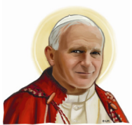
St. John Paul II Karol Wojtyla 5-18-1920 - 4-2-2005 Pope 1978 - 2005 Feast Day: October 22nd

“The world you are inheriting is a world which desperately needs a new sense of brotherhood and human solidarity. It is a world which needs to be touched and healed by the beauty and richness of God’s love.”