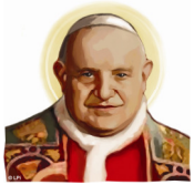
St. John XXIII Angelo Roncalli 11-25-1881 - 6-3-1963 Pope 1958 - 1963 Feast Day: October 11th

“Peace is but an empty word, if it does not rest upon that order . . . That is founded on truth, built up on justice, nurtured and animated by charity, and brought into effect under the auspices of freedom . . . human resources alone, even though inspired by the most praiseworthy good will, cannot hope to achieve it. God Himself must come to man’s aid with His heavenly assistance.”